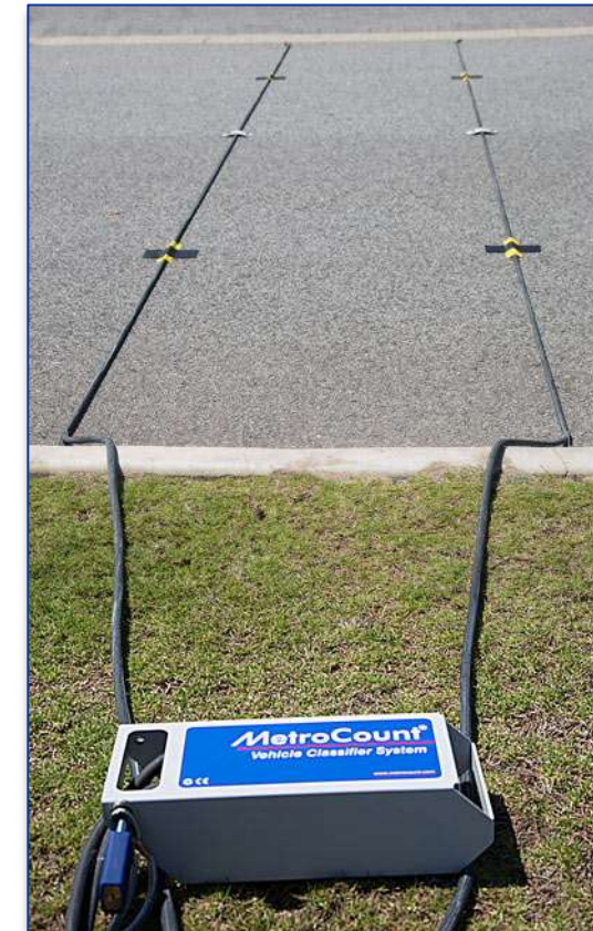
Traffic volume counter