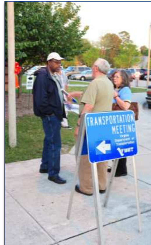
Citizen Information Meeting